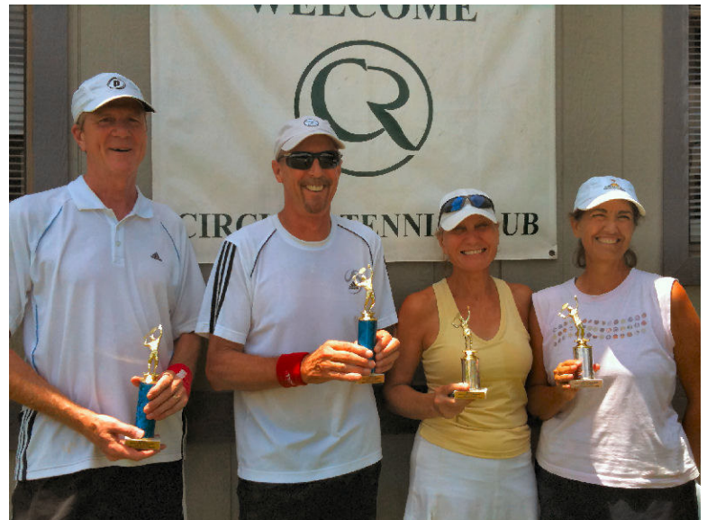
This is from the Circle C Adult NTRP Tournament held in July.

Sunday 4:00 p.m. Mixed USTA Combined 8.0 Team Play